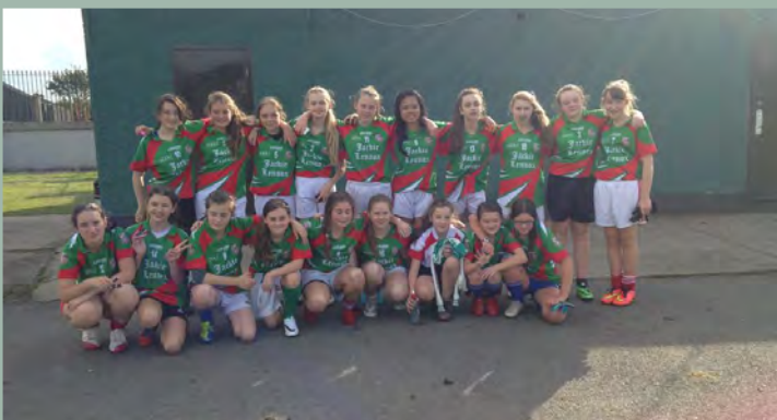
JUNIOR FOOTBALL TEAM