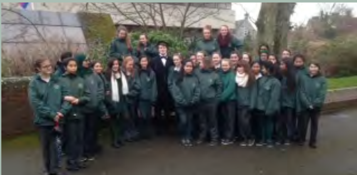
GEORGE BOOLE TOUR, UCC