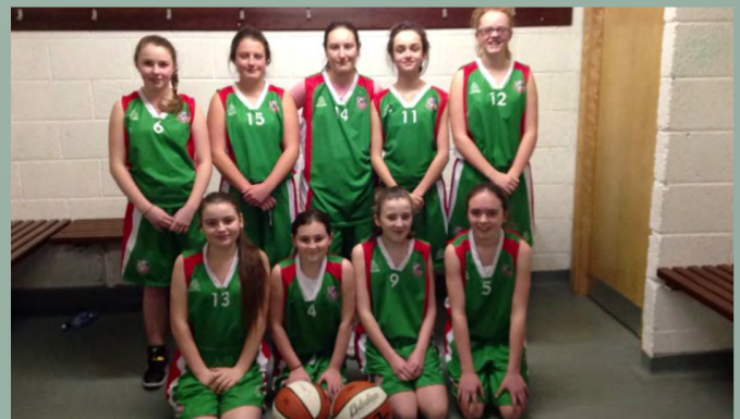
FIRST YEAR BASKETBALL TEAM