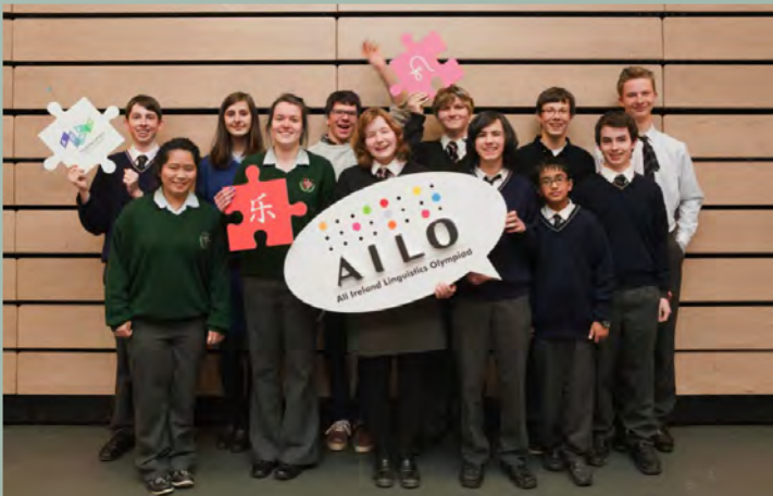
ALL IRELAND LINGUISTIC OLYMPIAD UCD