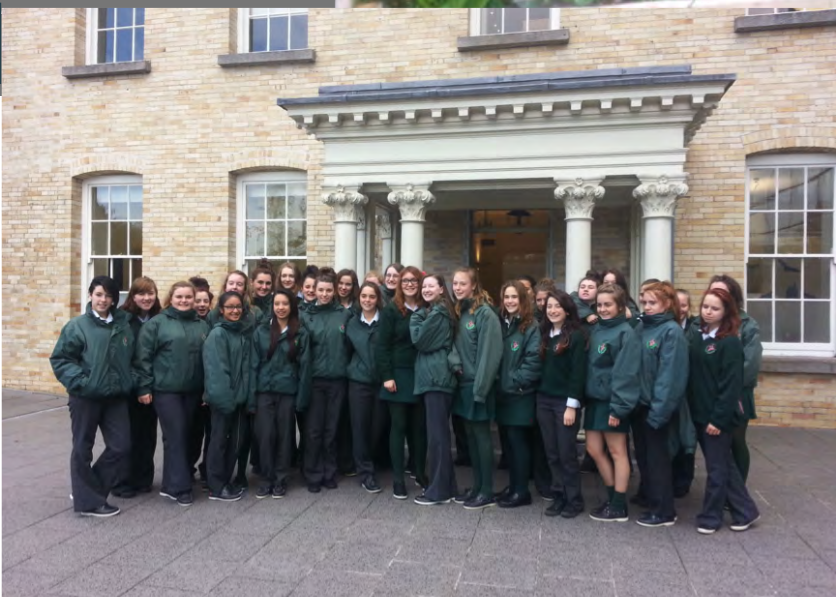
Students enjoying a day out in UCC in October 2014, where they attended a seminar on the relationship between Maths and Music.

Other interesting areas of mathematics examined included the fascinating phenomenon of the Fibonacci sequence, the golden ratio in nature, and the story of pi. Trigonometry was taken outside the classroom when home made clinometers were used to measure the height the school. Homage was also paid to George Boole when investigating binary mathematics.