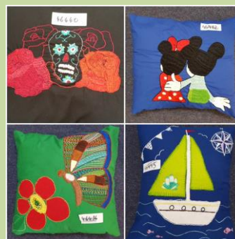
Junior Cert Crafts