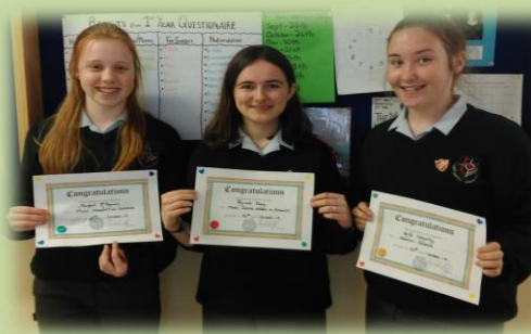
TY pupils who took part in the Debating Competition