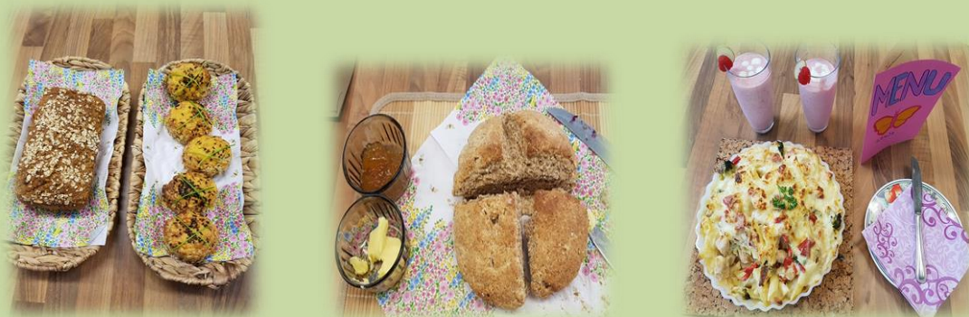
Junior Cert Cookery Exams