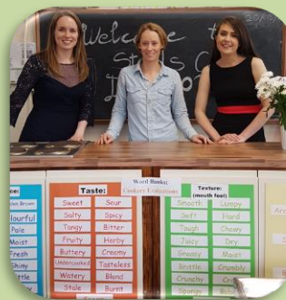
St. AIs Bake Off