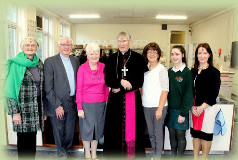
Blessing of the Home Economics Room