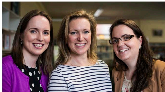
Rachel Allen with our Home Economics teachers

The Home-Economics and P.E Department ran a Healthy Eating and Fitness Week in March. A variety of activities took place emphasising the importance of local and healthy foods, in addition to exercise and fitness. We had visits from Arbutus Bread, Rawbina and Ballycotton Seafood. The highlight of the week was a visit from the TV Chef Rachel Allen.