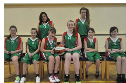
1st and 2nd year Basketball teams