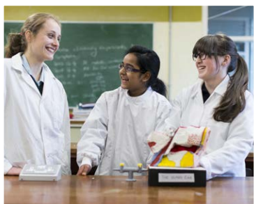
Alexsandra susan serena Gabor limit

In summary the projects discovered that: the limit to the human ear distinguishing between two distinct notes is reliant on a whole wave at the frequency being formed; eggs lose less mass when kept in the fridge and thus stay fresher; mathematically engineering a fallen object to standing requires some seriously difficult mathematics; we can identify faces from our own race better than faces from other races and finally fine art and perspective can be aligned to the geometric shape called the lute of Pythagoras which is laden with golden ratios.