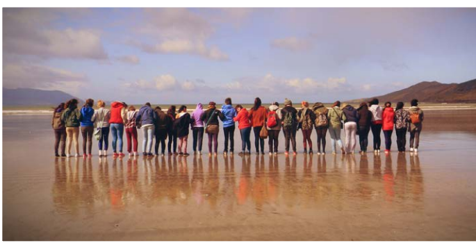
TY Trip to West Kerry 2013