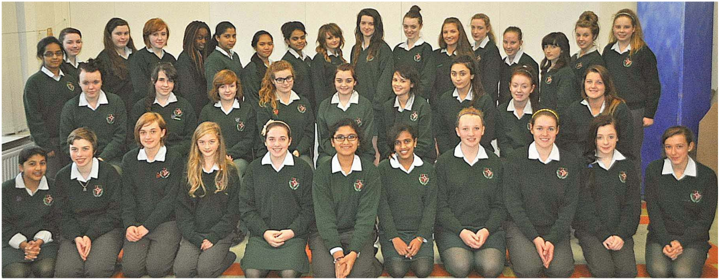
Student Council 2013 -14

The Student Council will conclude this academic year by meeting with the Board of Management. We were delighted to accept this invitation and are looking forward to discussing our future plans and projects with the Board.