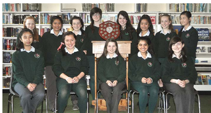
St. Al's Debating Group

The St. Aloysius Debating Society had a very successful year. The Society, under the guidance of their Senior Chairs, had very strong teams composed predominantly of 1st and 3rd year students. St. Als hosted two major debates including the annual first year Easter Mace which had a record attendance compared with previous years. St. Als' teams also entered numerous debates throughout the year with St. Als' speakers being placed in the top 10 in most debates. The Debating Society hopes to have an even more successful year in 2015.