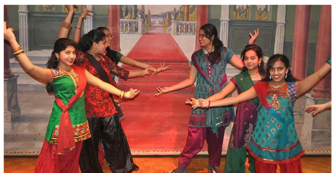
Transition year production of Beauty and the Beast