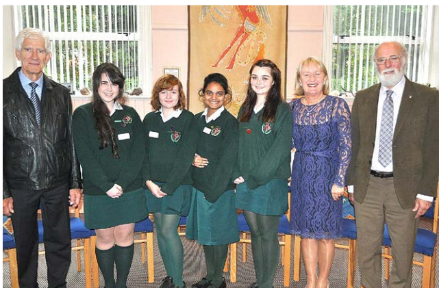
Rotary Youth Leadership Competition - 2013