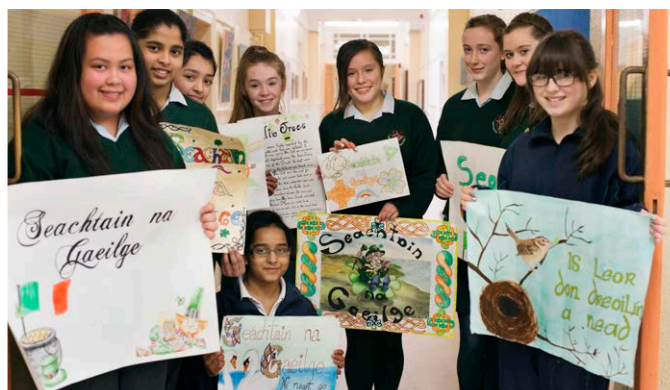
Seachtain na Gaeilge

Iarracht eile gur éirigh go maith leis i mbliana ná comórtas a reachtaíodh sa chéad bhliain do 'Gaeilgeoir na Míosa'. Tuigtear dúinn gur deineadh an-iarrachtaí ar fad – go háirithe i dtreo dheireadh na míosa – le go mbuafaí an duais bheag agus an teastas a bhí ann don bhuaitheoir.