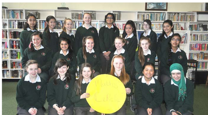
St. Aloysius Maths Circle